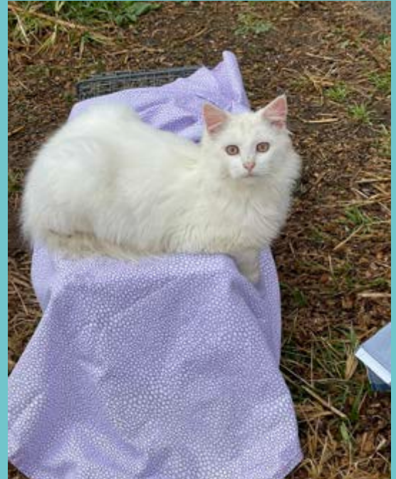
Sometimes kitties make TNR easy!

Spay/neuter assistance is the one of the most important programs we offer to make a long-term difference in shelter intake and euthanasia. Please help us keep making a BIG DIFFERENCE by contributing to Beat the Heat from February 15th to April 1st. You can save lives by donating on our website or mailing us a check during that time. (Note: Donations must be above and beyond recurring or pledged donations.)